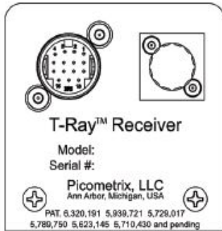
BACK OF Rx HEAD