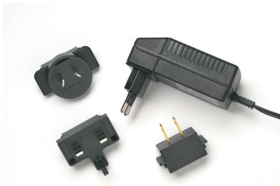
Worldwide compatible AC adapter/charger (SNT-121A)