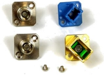
Optical adapters (BN 2155) for signal input