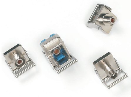
Optical adapters (BN 2150) for laser source output