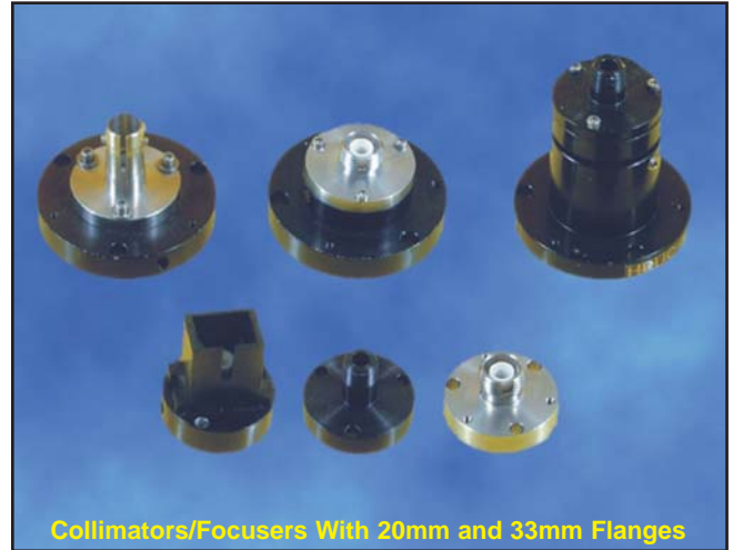
Collimators/Focusers With 20mm and 33mm Flanges

OZ Optics standard tables list the definitions used for each fiber type, as well as conversion factors to convert values to 1/e^2 values. OZ Optics uses 1/e^2 definitions for its calculations of the beam diameter wherever possible.