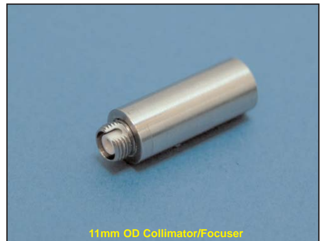
11mm OD Collimator/Focuser