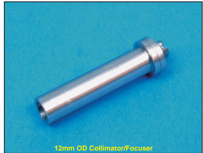
12mm OD Collimator/Focuser