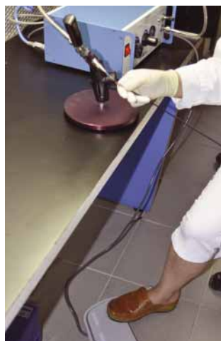
OZPEN cleaning high power patchcord.