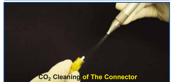
CO 2 Cleaning of The Connector