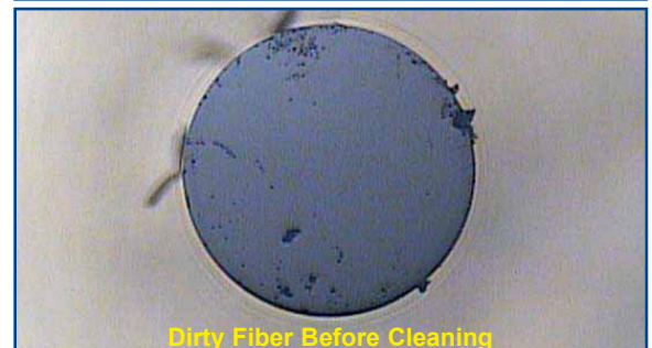
Dirty Fiber Before Cleaning