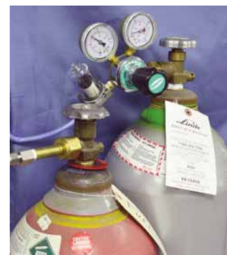
CO 2 & N 2 Cylinders, typical gas supply (USA) connection shown.