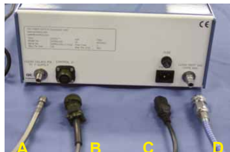
Back of the unit connections