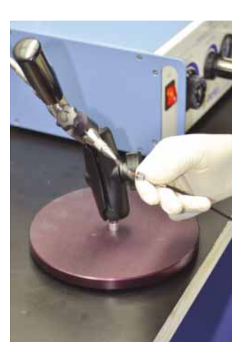
Fiber optic connector cleaning - close up.