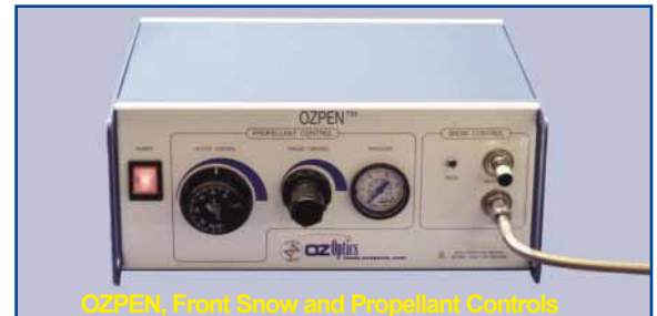
OZPEN, Front Snow and Propellant Controls

Each OZPEN is equipped with a flexible coaxial tube, spray pen applicator, and foot switch. The basic system provides precision cleaning capability right out of the box and includes all components for precision cleaning apart from the process gases.