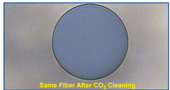
Same Fiber After CO 2 Cleaning