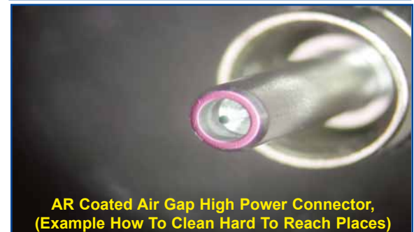
AR Coated Air Gap High Power Connector, (Example How To Clean Hard To Reach Places)