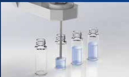
Dispensing into vial bottles