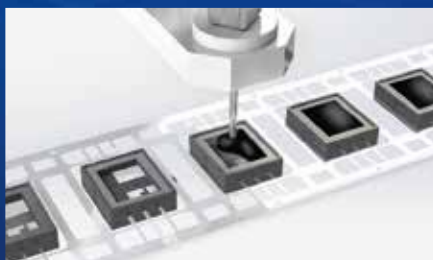
Potting sensor components