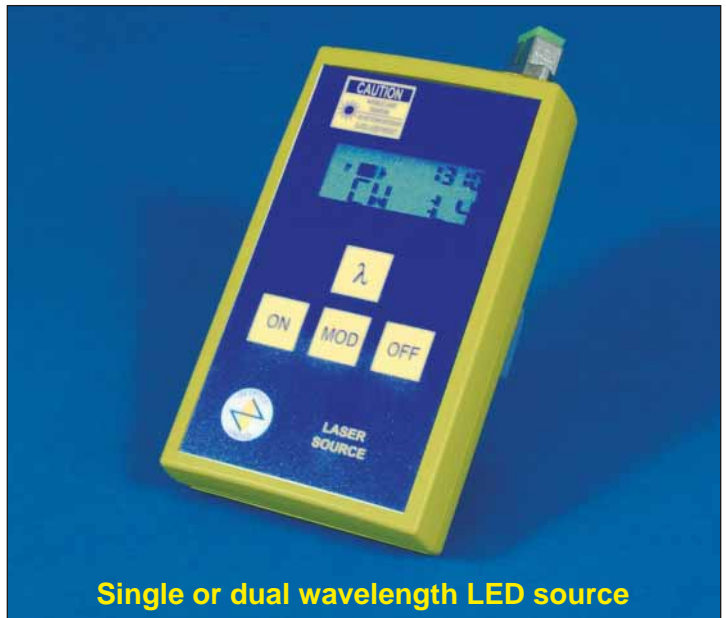
Single or dual wavelength LED source