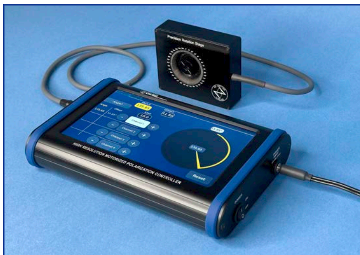
A single rotation stage along with a control unit and built-in touch-screen is powered up using 5V DC power supply.

The software and the associated GUI can be modified upon request and a Python library is available.