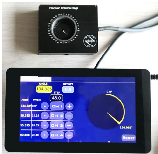
Fig.2: A single rotation stage along with a control unit and built-in touch-screen is powered up using 5V DC power supply.