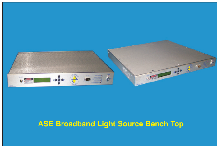
ASE Broadband Light Source Bench Top