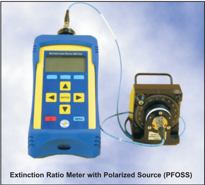
Extinction Ratio Meter with Polarized Source (PFOSS)

OZ Optics ER Meter for PM V-Groove array's provides for fast and accurate extinction ratio measurements of V-Groove assemblies manufactured with PM fiber. The semi-automated system is computer controlled for hassle free control and measurements. The system consists of a polarized stable light source, 3 axis measurement micro-stage with one axis motorized, an extinction ratio display set and PC software to control the system. The stage and meter display are connected to a PC using USB cables. The system is capable of measuring extinction ratios up to 40dB with an angle accuracy of 1.5°. The ordering information is as follows: