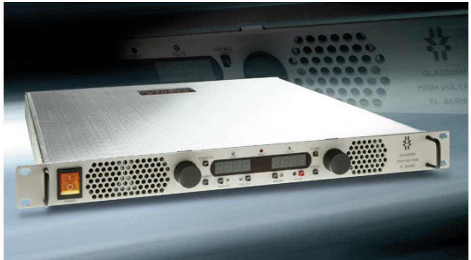
Models from 0 to 750 V through 0 to 1500 V, 1.72" H x 19" W x 20" D, 15 lbs.

EN61000-3-2, Line Harmonics EN61010/ IEC1010, Safety EN61000-6-4, Conducted and Radiated Emissions EN61000-6-2:2005, Conducted and Radiated Immunity 2011/65/EU, Restriction of the use of hazardous substances (RoHS).