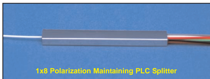
1x8 Polarization Maintaining PLC Splitter

In general OZ Optics uses polarization maintaining fibers based on the PANDA fiber structure when building polarization maintaining components and patchcords. However OZ Optics can construct devices using other PM fiber structures. We do carry some alternative fiber types in stock, so please contact our sales department for availability. If necessary, we are willing to use customer supplied fibers to build devices.