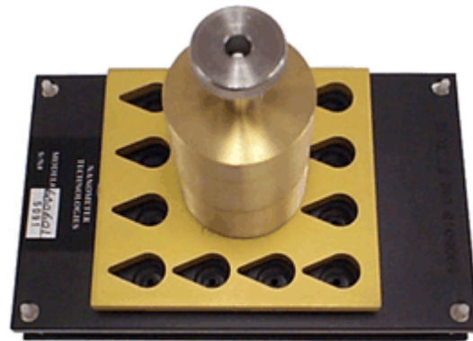
UNI-12 Fixture Plate

The UNI Fixture Plates are easy to use and are very low in maintenance. These fixture plates require no calibration and are ready to go out of the box.