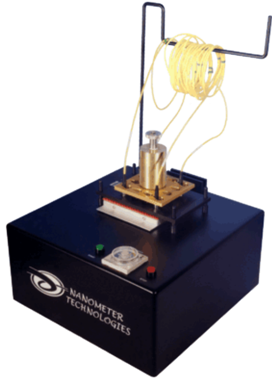
Figure 8 Polishing:

If you're on a budget and need a high quality polisher, the MCP 12 is made for you. The MCP 12 is incredibly easy to use with a very small learning curve so you won't lose valuable production time. With exclusive figure 8 polishing, universal fixture plates, and low consumable costs this machine will quickly become an asset to your company.