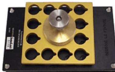
LC & MU - 12 position