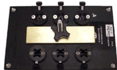
SC/APC - 8 position