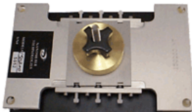
MT - 6 position