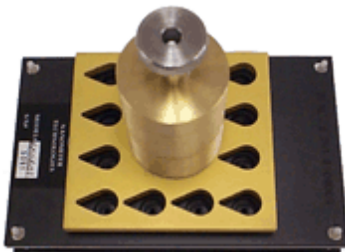
UNI-12 - 12 position FC / SC / ST / ESCON / FDDI / DIN most 2.5mm ferrule