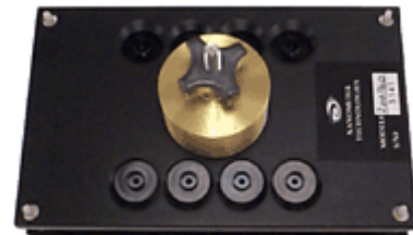
FC/APC - 8 position