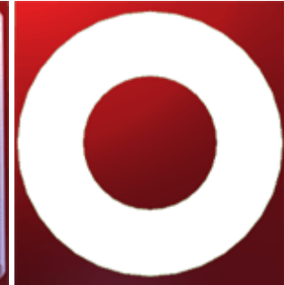
Lapping Film from circular polishing machines.